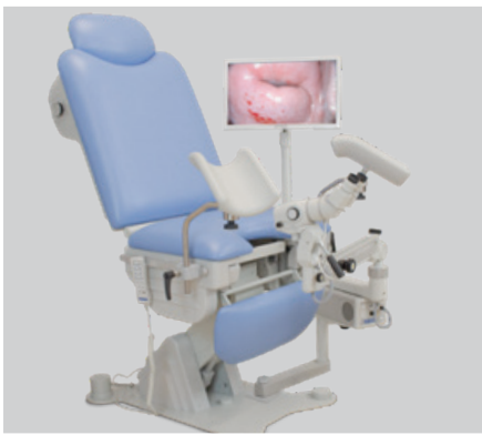
Colposcope Support (OPTIONAL)