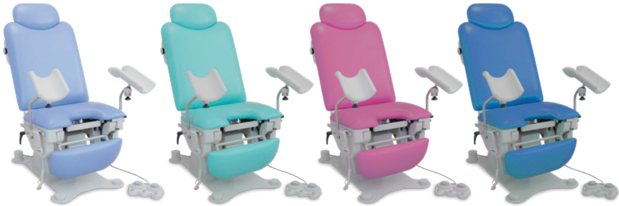
A wide range of colour available